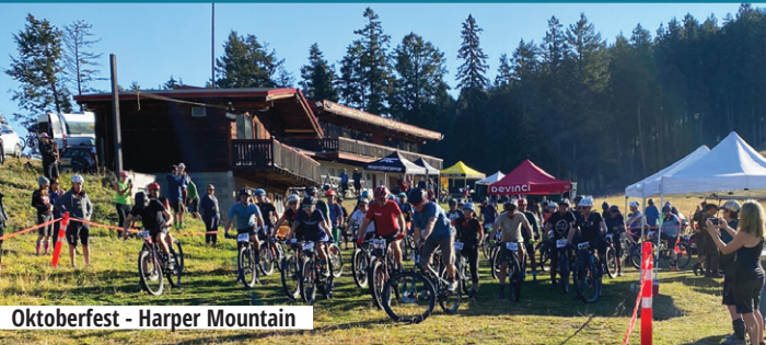
Oktoberfest - Harper Mountain