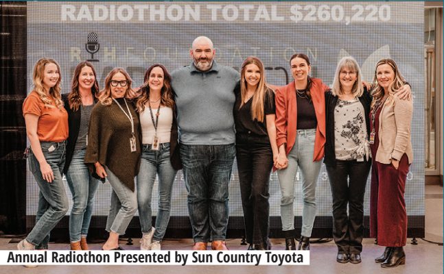
Annual Radiothon Presented by Sun Country Toyota