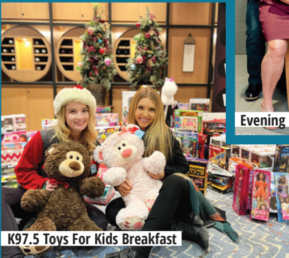
K97.5 Toys For Kids Breakfast