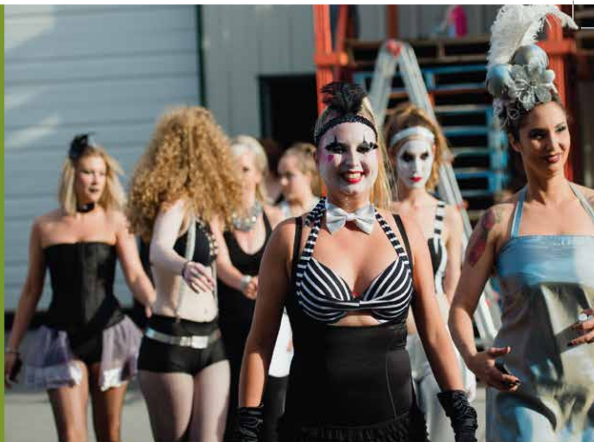
Enthralling entertainment at this years Royal Affair held at High Country Cold Storage.

Check out more photos at www.rihfoundation.ca