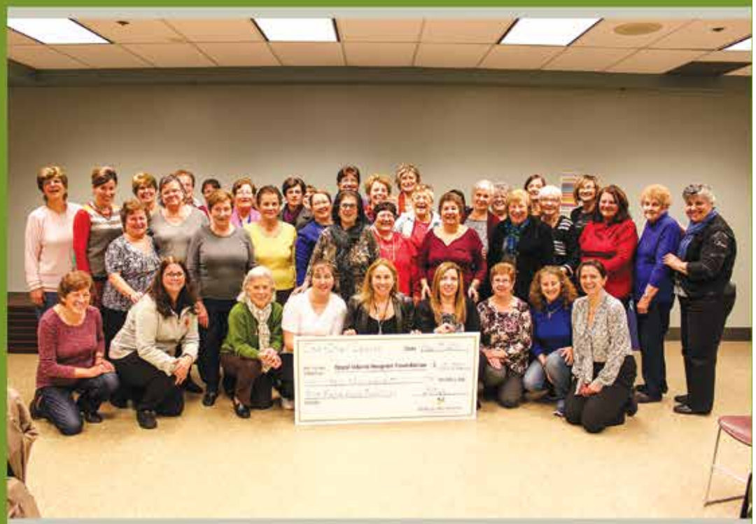
Can-Ital Ladies pledge their support to the Breast Health Clinic.