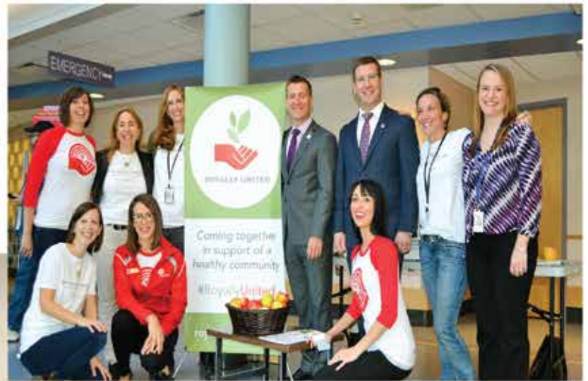
Above: Staff and sponsors kick off the Royally United Campaign.

The Foundation Lottery is grateful to the support of the RIH staff who continue to make the hospital lottery a huge success! The lottery is a 50/50 style draw held in the cafeteria every 2 weeks with jackpots reaching as much as $3,400 in recent months. Started by the Evening Auxiliary and handed over to the Foundation in 2015, the staff lottery raised over $65,000 last year in support of patient care equipment.