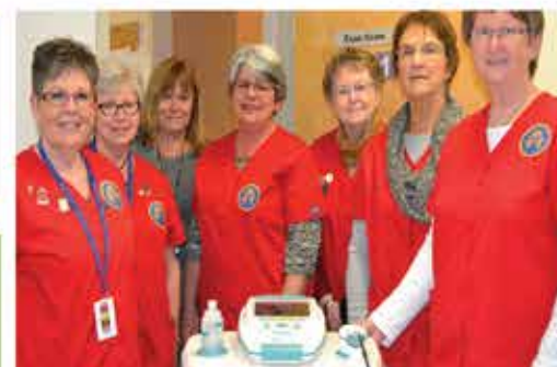
Members of the Afternoon Auxiliary present new equipment to staff at RIH.

Last year, the Evening Auxiliary purchased over $150,000 in equipment. This equipment has provided much needed support to the Respiratory Therapy department, Neonatal Intensive Care Unit, and Maternity Unit in RIH.